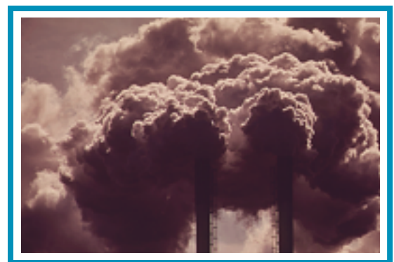
Figure 1: Smoke from the burning of discarded auto batteries from a factory near Houston, Texas, April 1972

In the 1950s and 1960s, Texans, along with the rest of America, observed that their major cities were beginning to be covered by