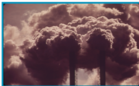
Figure 1. Smoke from the burning of discarded auto batteries from a factory near Houston, Texas, April 1972

This pollution was linked to unregulated emissions from cars, trucks, and factories. Since there were no controls on these sources, air pollution was rampant. The U.S. Congress passed the Clean Air Act (CAA) in 1970 and made major revisions in 1977 and 1990. Currently, the CAA requires the U.S. Environmental Protection Agency (EPA) to establish air quality standards for six key criteria air pollutants that are the most dangerous to humans and the environment: carbon monoxide, nitrogen dioxide, ozone, particulate matter, sulfur dioxide, and volatile organic compounds. The CAA also requires states to adopt enforceable plans to achieve and maintain those standards.